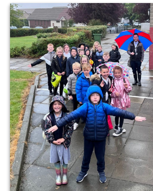
On our way to our first swimming lesson!

If you have any queries or concerns about your child please do not hesitate to get in touch. Please contact the school office by telephone or email—they will be happy to answer any queries you may have or if you wish to speak to me on the phone and I will return your call.